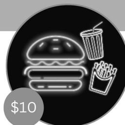
Fast-Food Combo Lunch