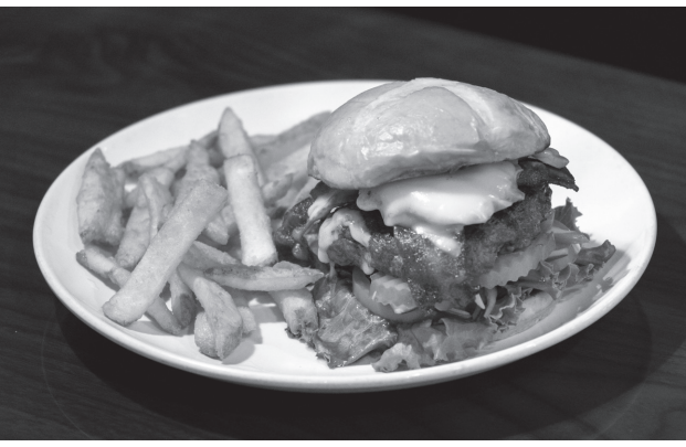
The Grill at River City's popular Bacon-Avocado-Swiss burger.

The Grill at River City is a locally-owned restaurant and sports bar. Be sure to stop in and try a hand-cut steak, beer battered shrimp, onion rings and many other items that are made from scratch daily with fresh ingredients.